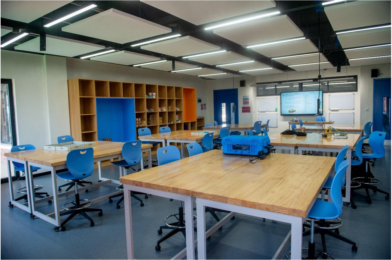
Primary School Stem Room

The school offers an international education for students aged 5 to 18 (Years 1 to 13) using the British curriculum and leading to the IGCSE and A level qualifications. These will allow our students to aspire to the very best universities worldwide.