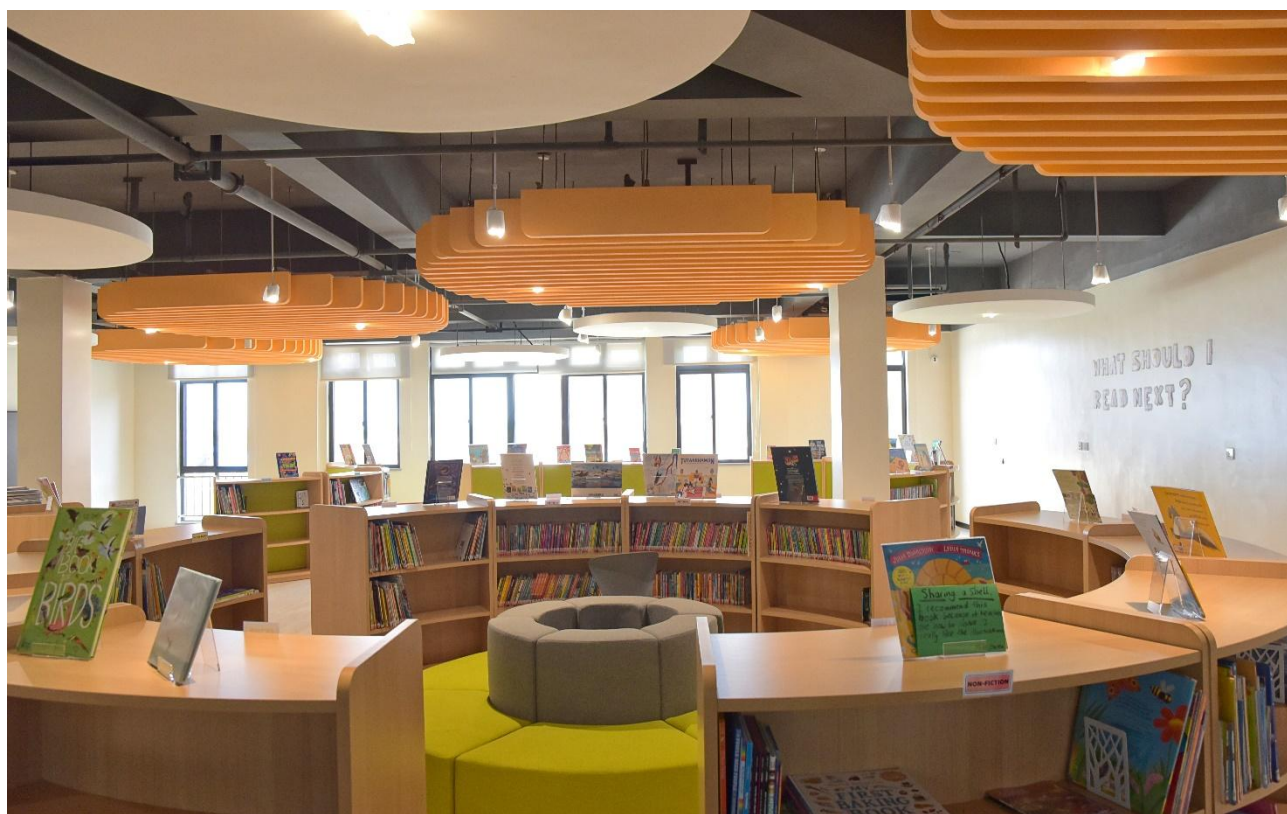
Primary School Library