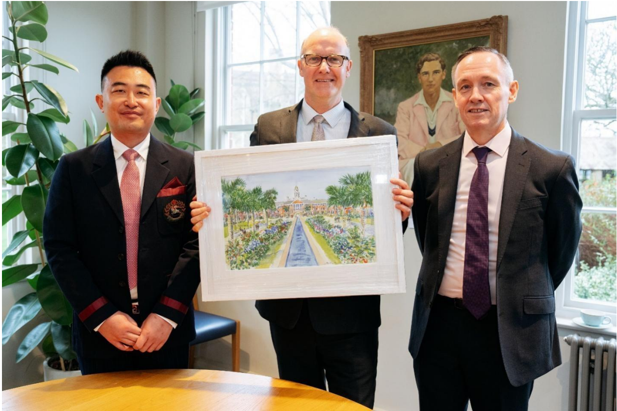
Official signing of the Charterhouse Lagos Agreement at Charterhouse UK